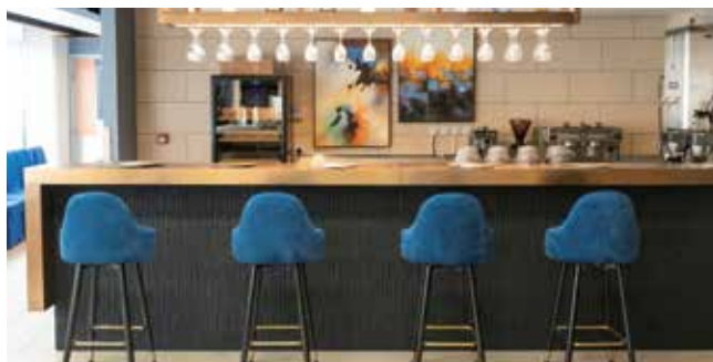
Training Bar and Restaurant