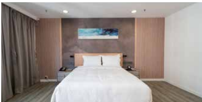
Simulation Guest Room