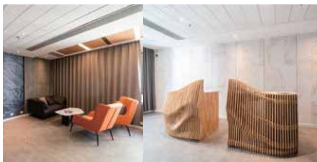
Simulation Front Desk